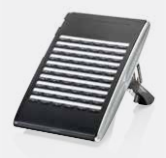
8-line Key Module